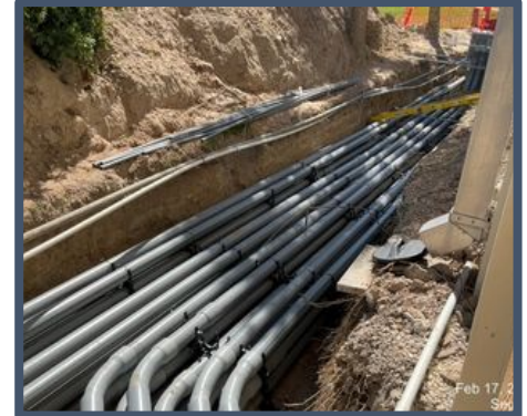
Underground Utilities Installation