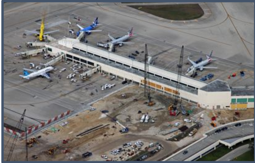
Auger Piles installation