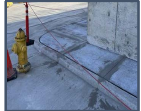
Stairwell, Slab on Grade and sidewalks