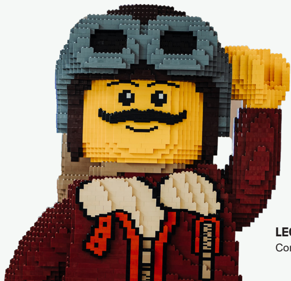
LEGO Store Concourse D