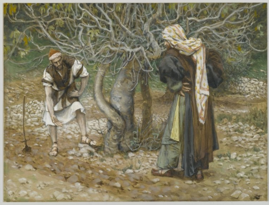
Family of St. Andrews,

The first words Jesus speaks in the Gospel of Mark are this: "The time is fulfilled, and the kingdom of God is at hand; repent and believe the gospel" (1:15). Something interesting to think about is that fact that many scholars believe St. Mark's Gospel was the first Gospel written. Matthew and Luke came afterward, with the Gospel of John being a distant fourth in the chronology. If that is true, then this means these words—although not the first words heard from our Lord—are the first words of Jesus written in the New Testament.