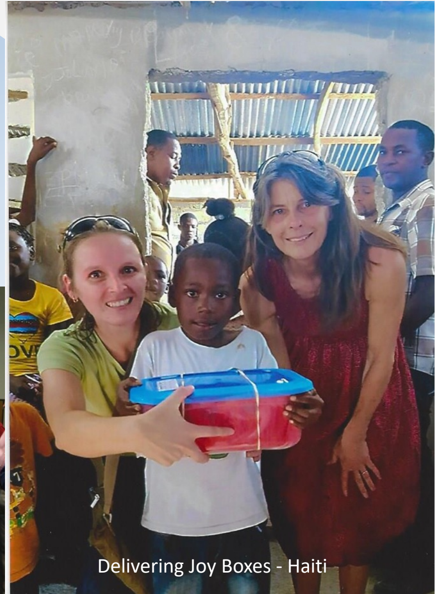
Delivering Joy Boxes - Haiti