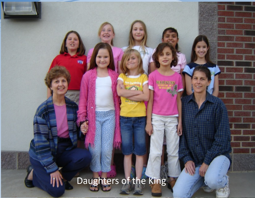
Daughters of the King