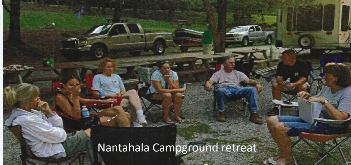
Nantahala Campground retreat