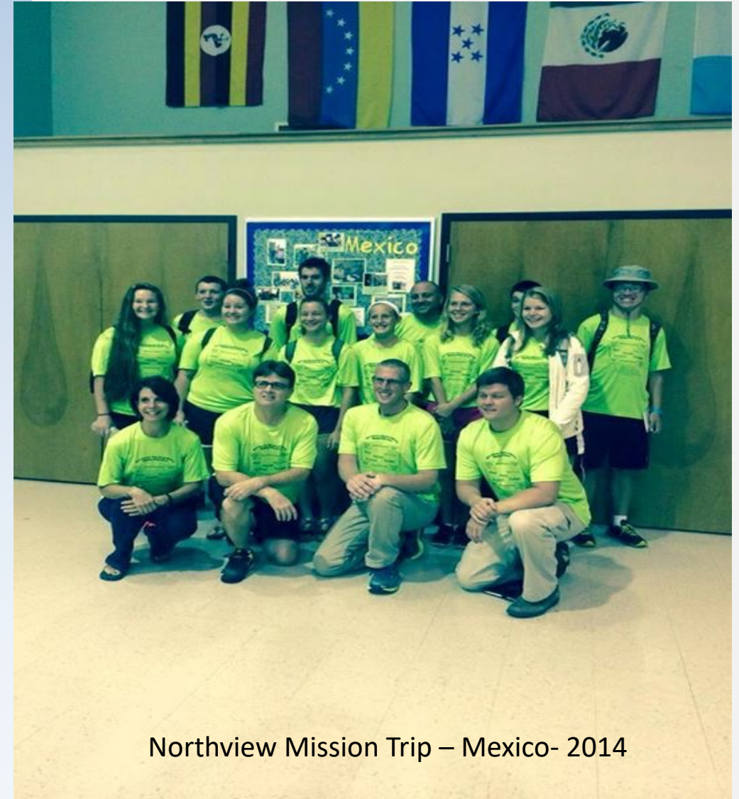
Northview Mission Trip – Mexico- 2014