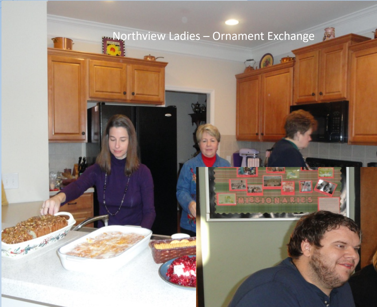
Northview Ladies – Ornament Exchange