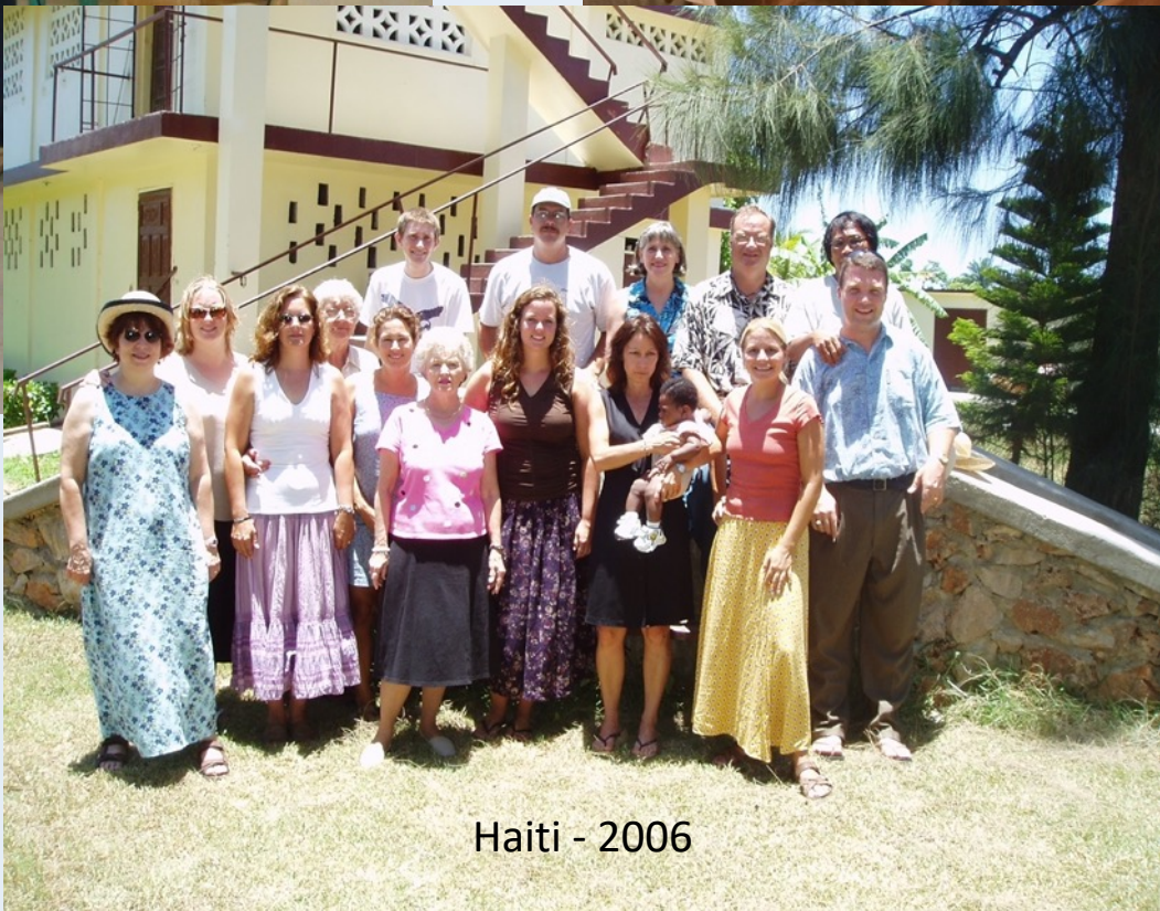
Haiti - 2006