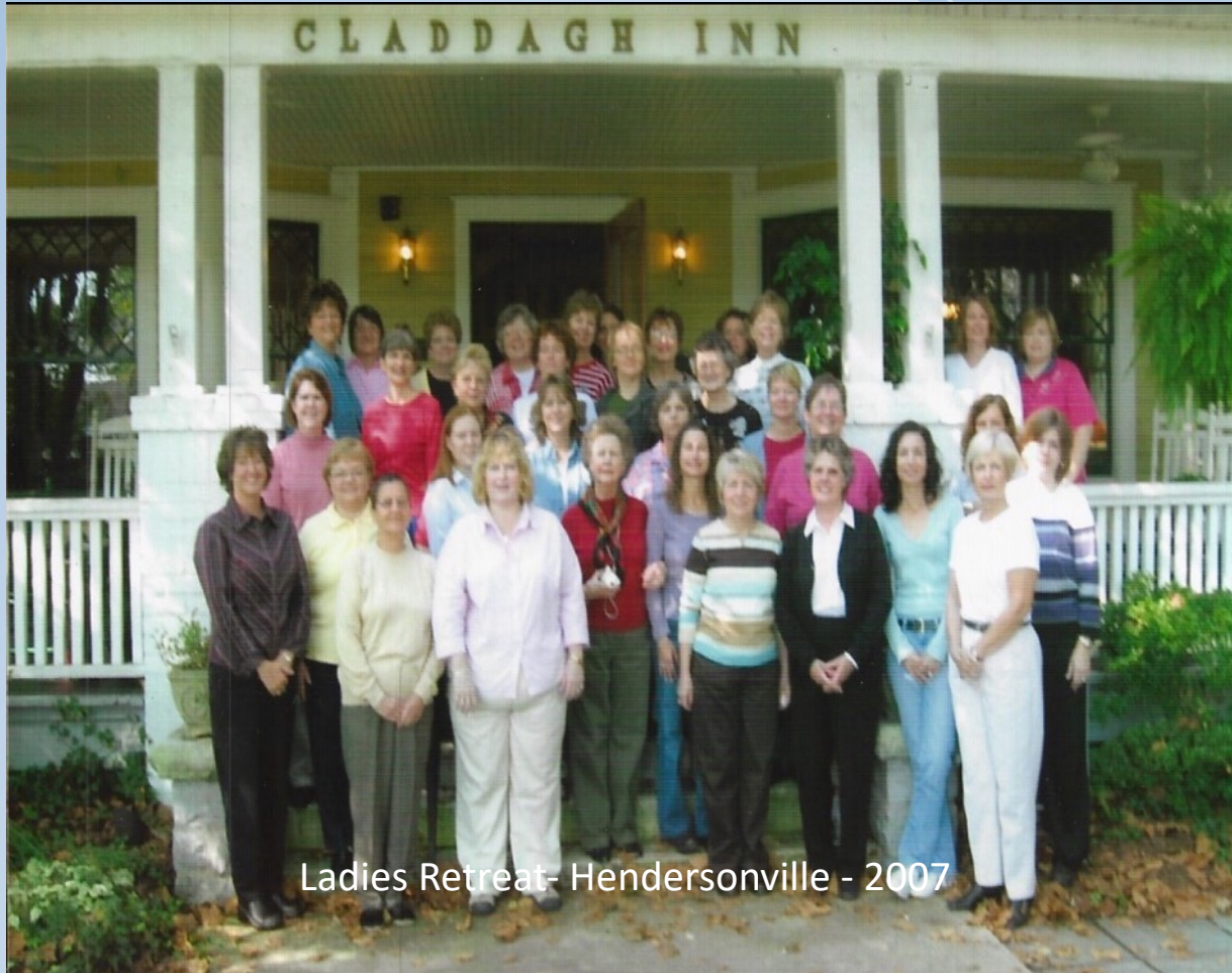
Ladies Retreat- Hendersonville - 2007