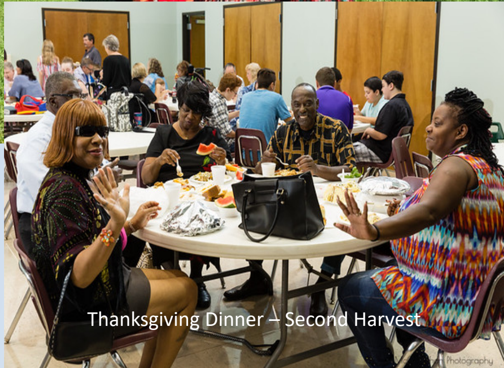
Thanksgiving Dinner – Second Harvest