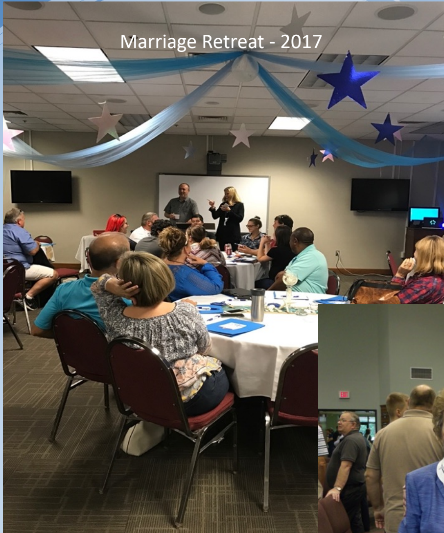
Marriage Retreat - 2017