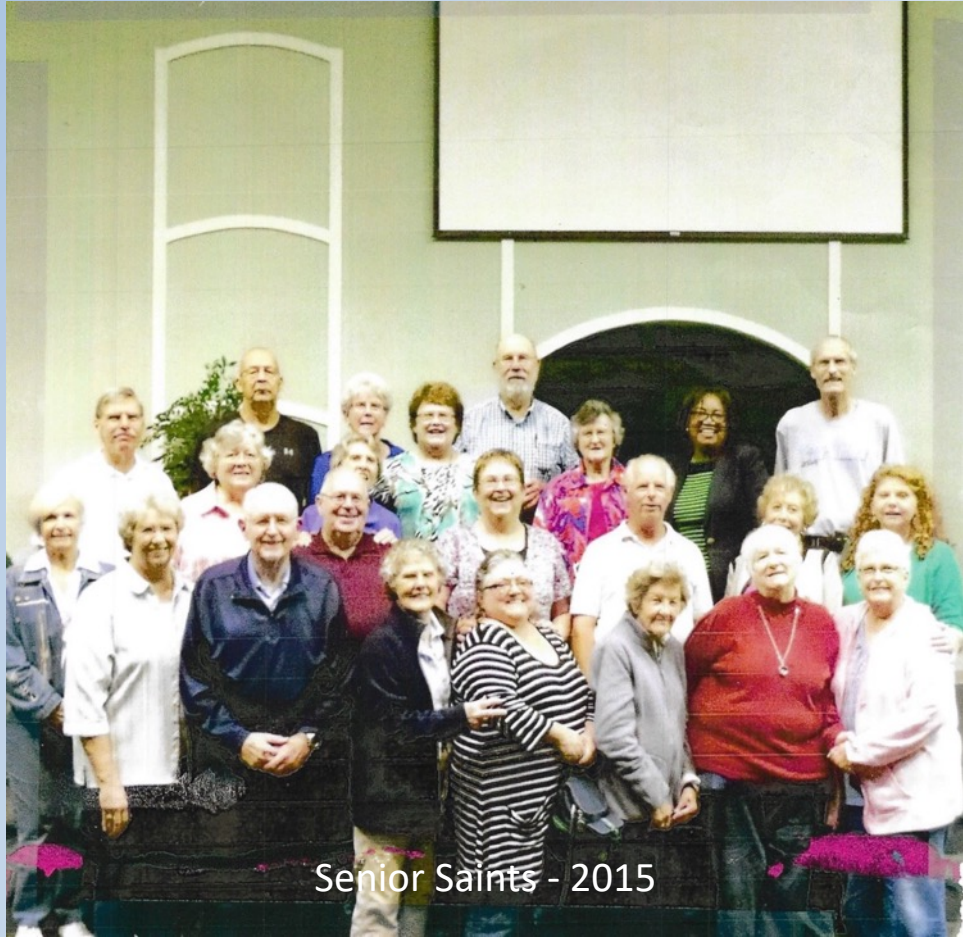
Senior Saints - 2015