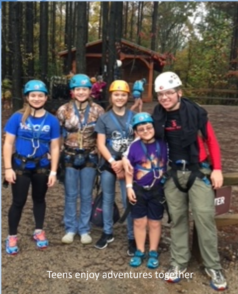
Teens enjoy adventures together