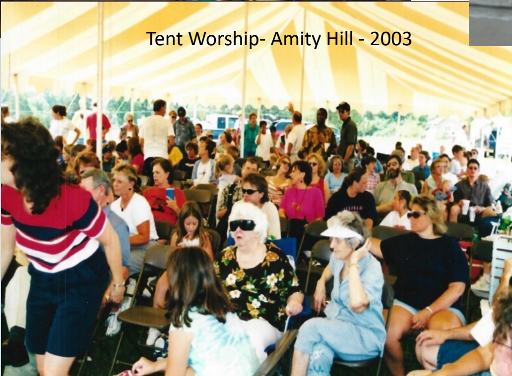
Tent Worship- Amity Hill - 2003