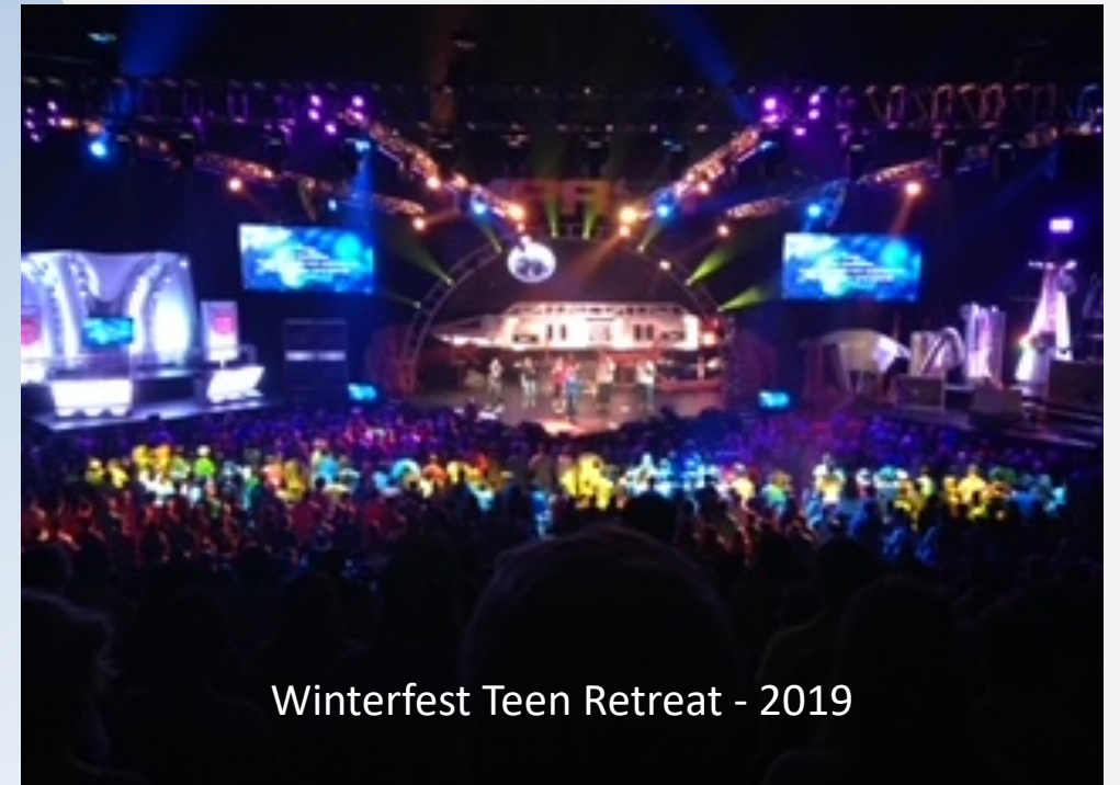
Winterfest Teen Retreat - 2019