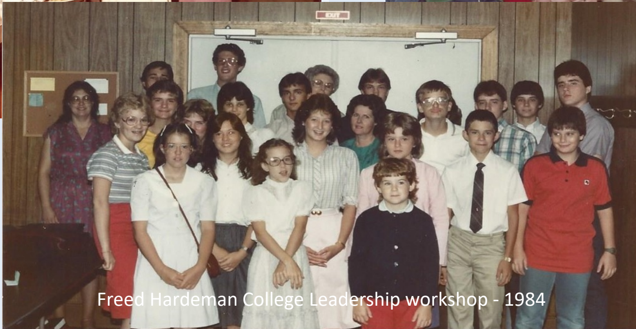
Freed Hardeman College Leadership workshop - 1984