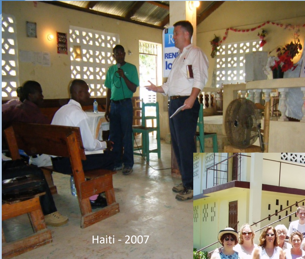
Haiti - 2007