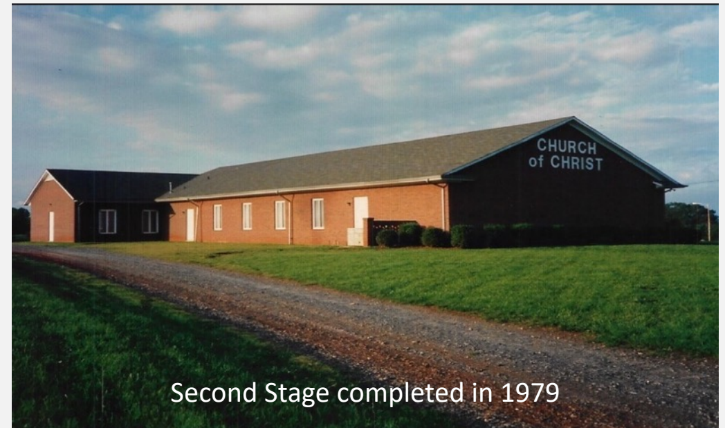
Second Stage completed in 1979