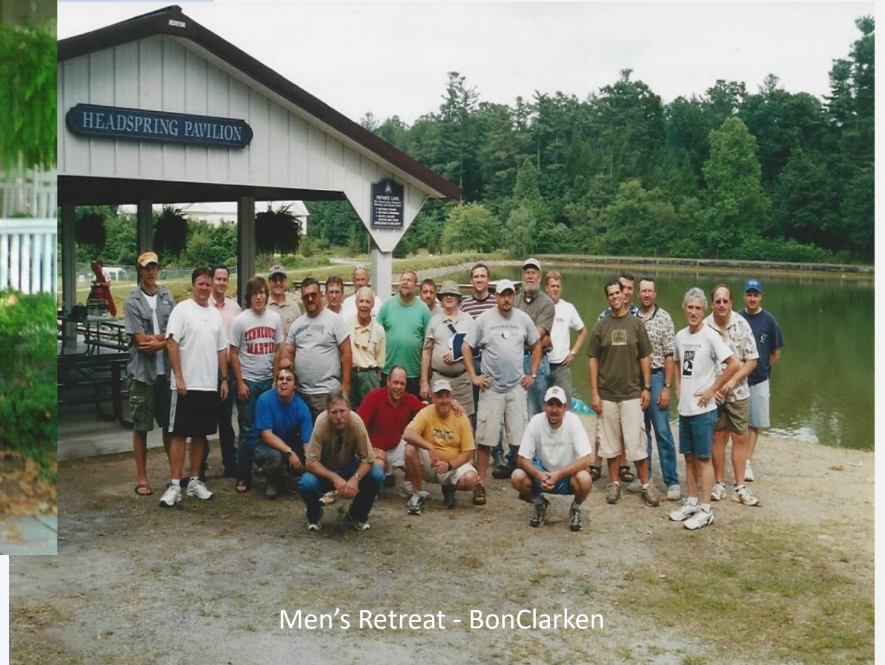
Men's Retreat - BonClarken