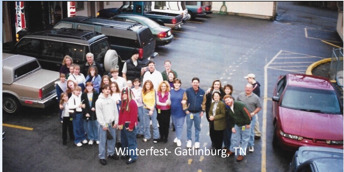
Winterfest- Gatlinburg, TN

The Wallers say they are committed to building stronger families for stronger churches for stronger communities, and anticipate a wonderful work in the new pastorate now assumed in Statesville.