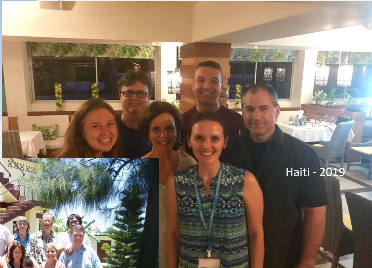
Haiti - 2019