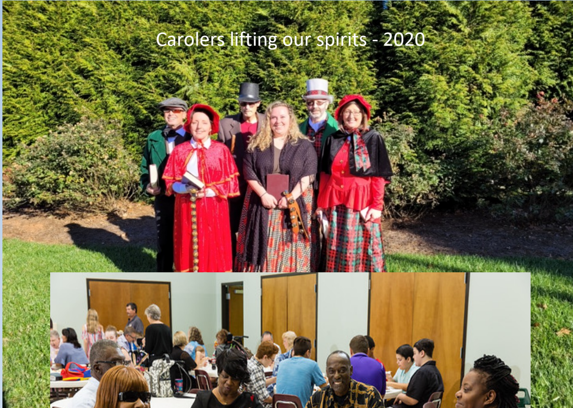
Carolers lifting our spirits - 2020