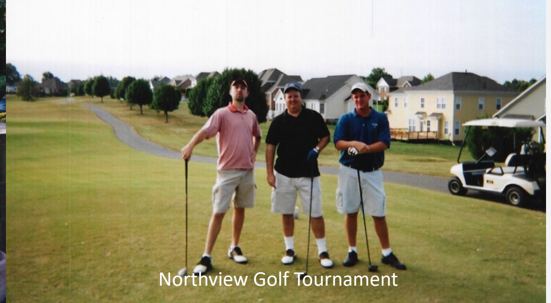
Northview Golf Tournament