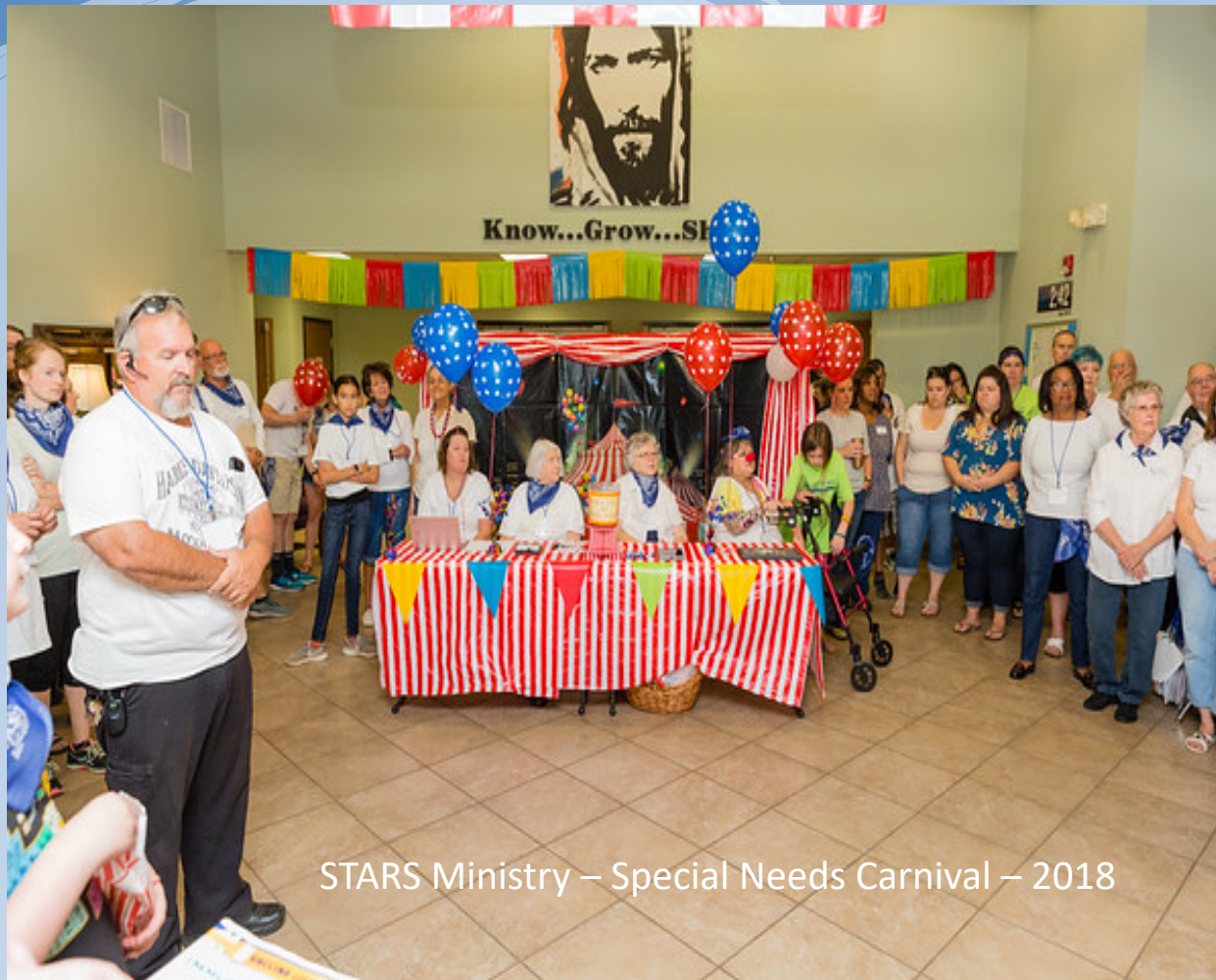
STARS Ministry – Special Needs Carnival – 2018