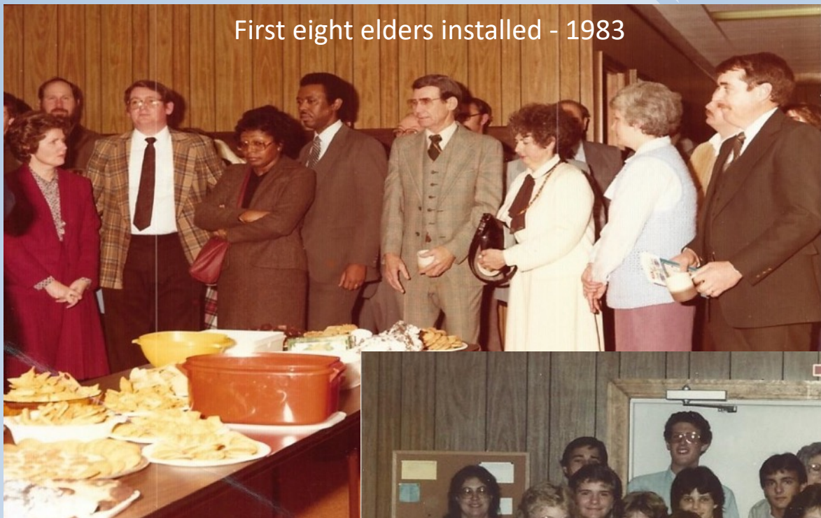
First eight elders installed - 1983