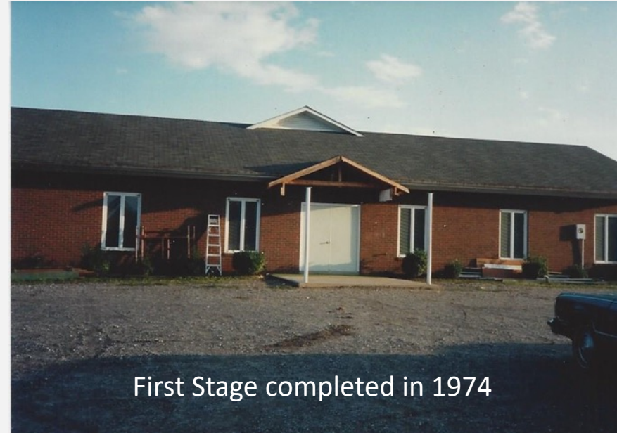
First Stage completed in 1974