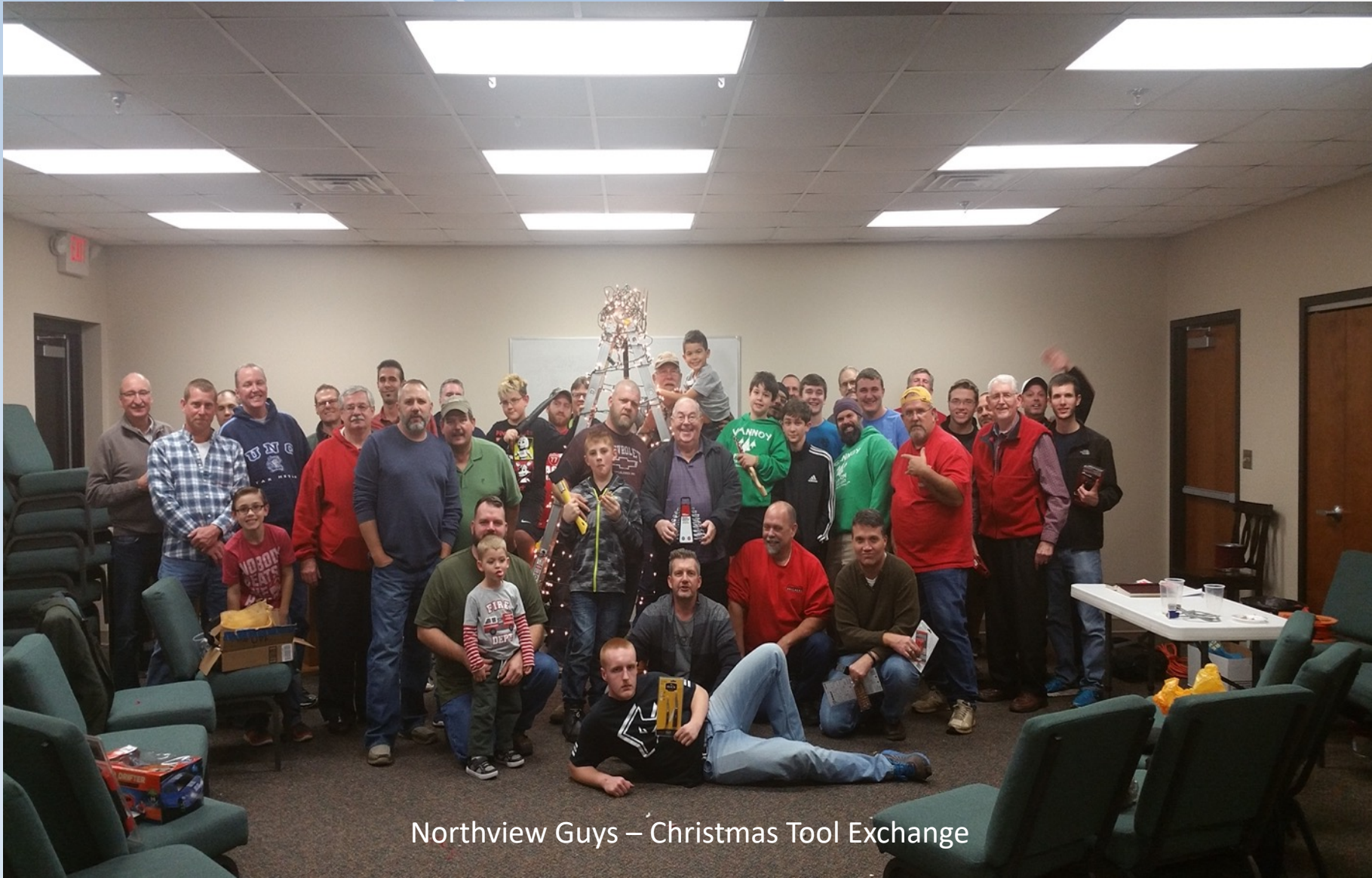
Northview Guys – Christmas Tool Exchange