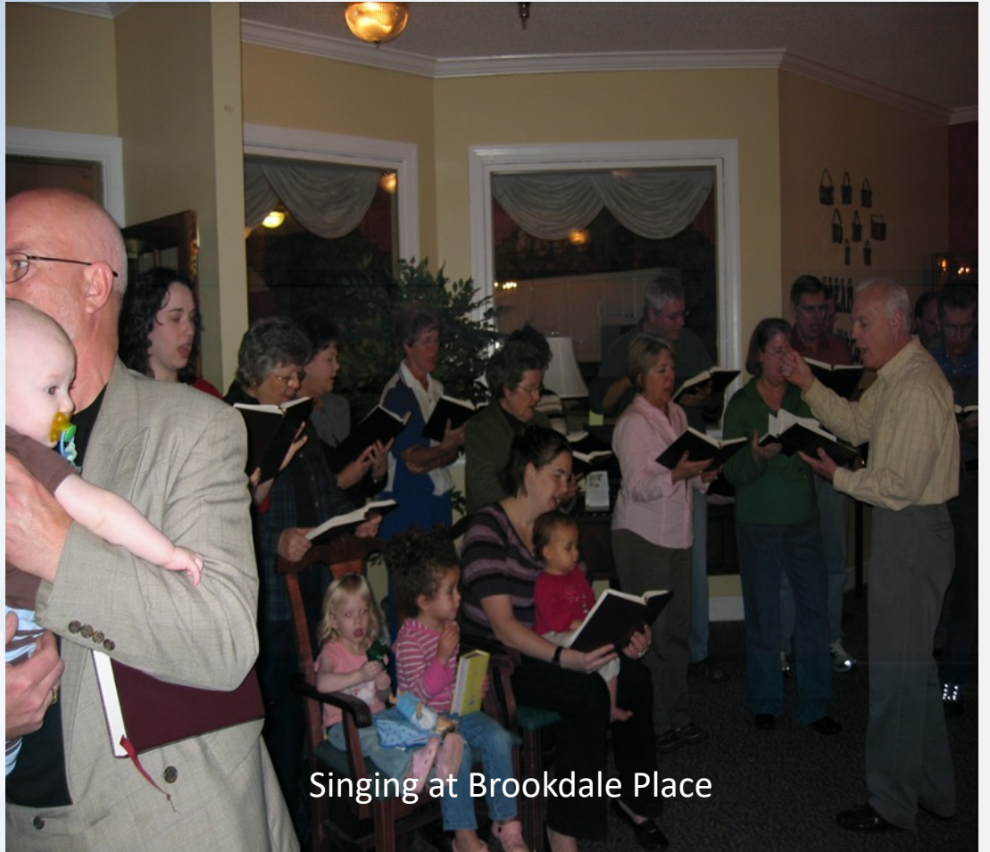
Singing at Brookdale Place