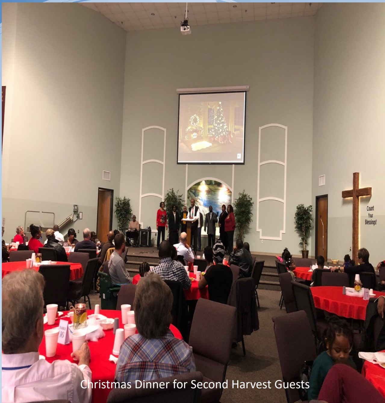
Christmas Dinner for Second Harvest Guests