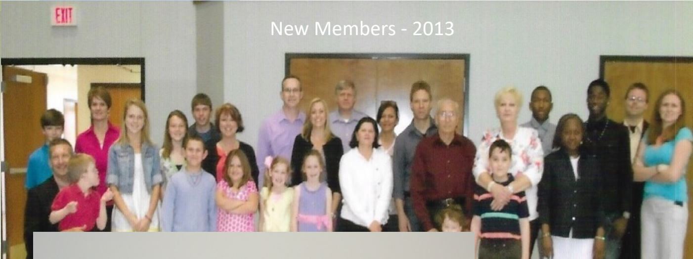
New Members - 2013