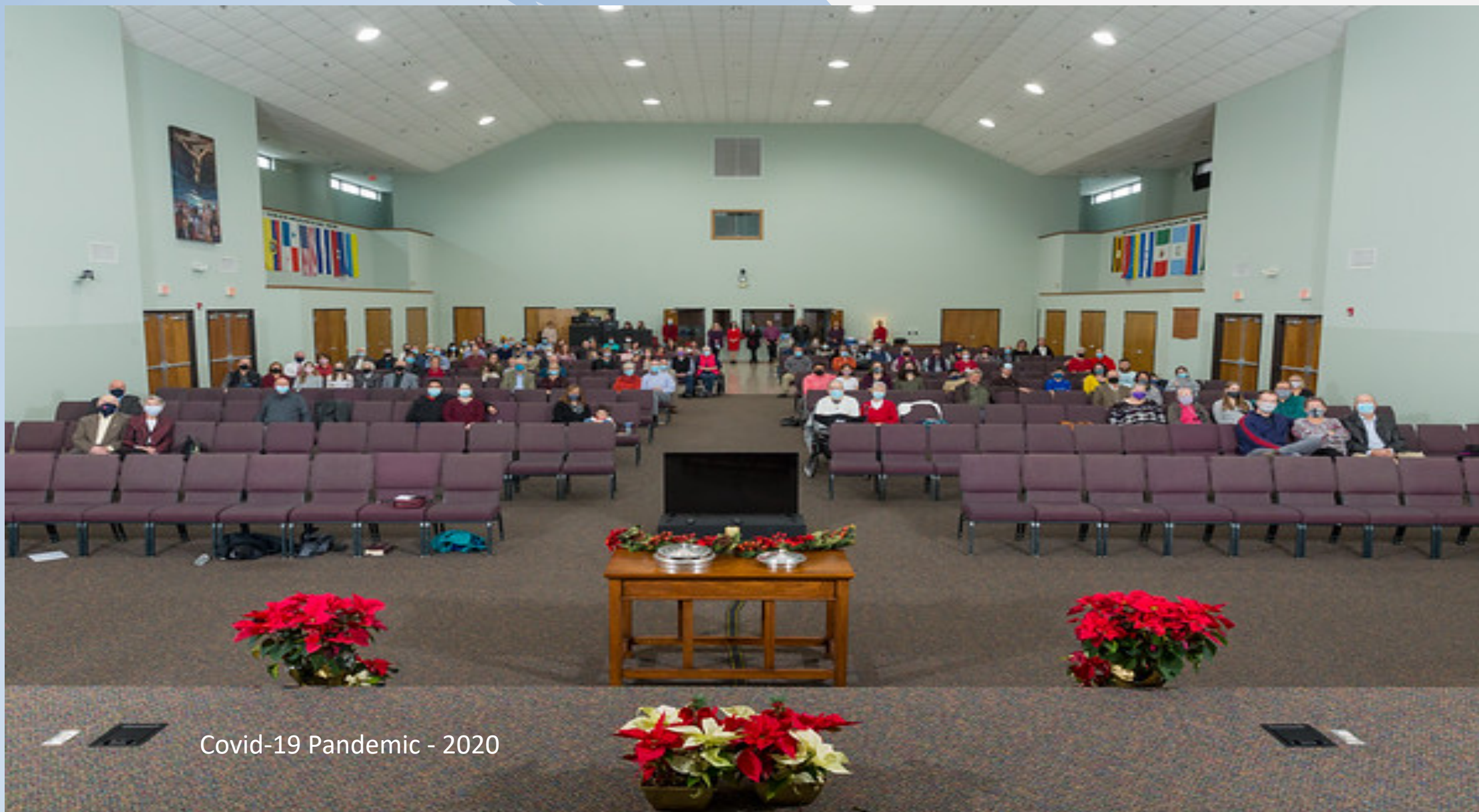
Covid-19 Pandemic - 2020