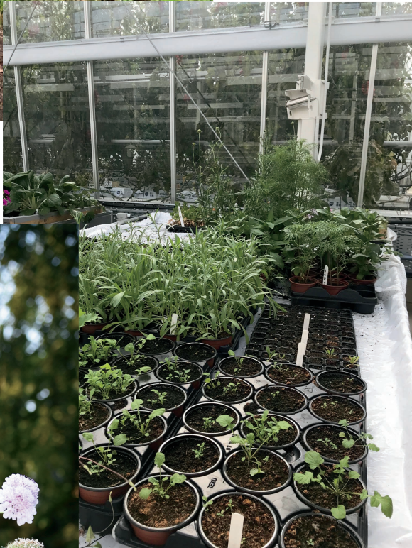
Wildflowers being grown at the National Centre for Horticulture the Environment and Sustainable Technology.