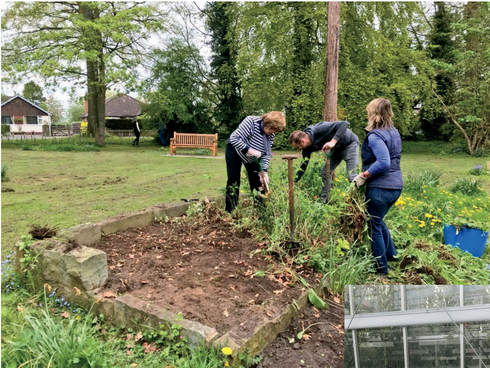
Volunteers helping to weed the bed on the Spinney ahead of a new wildflower scheme being planted.