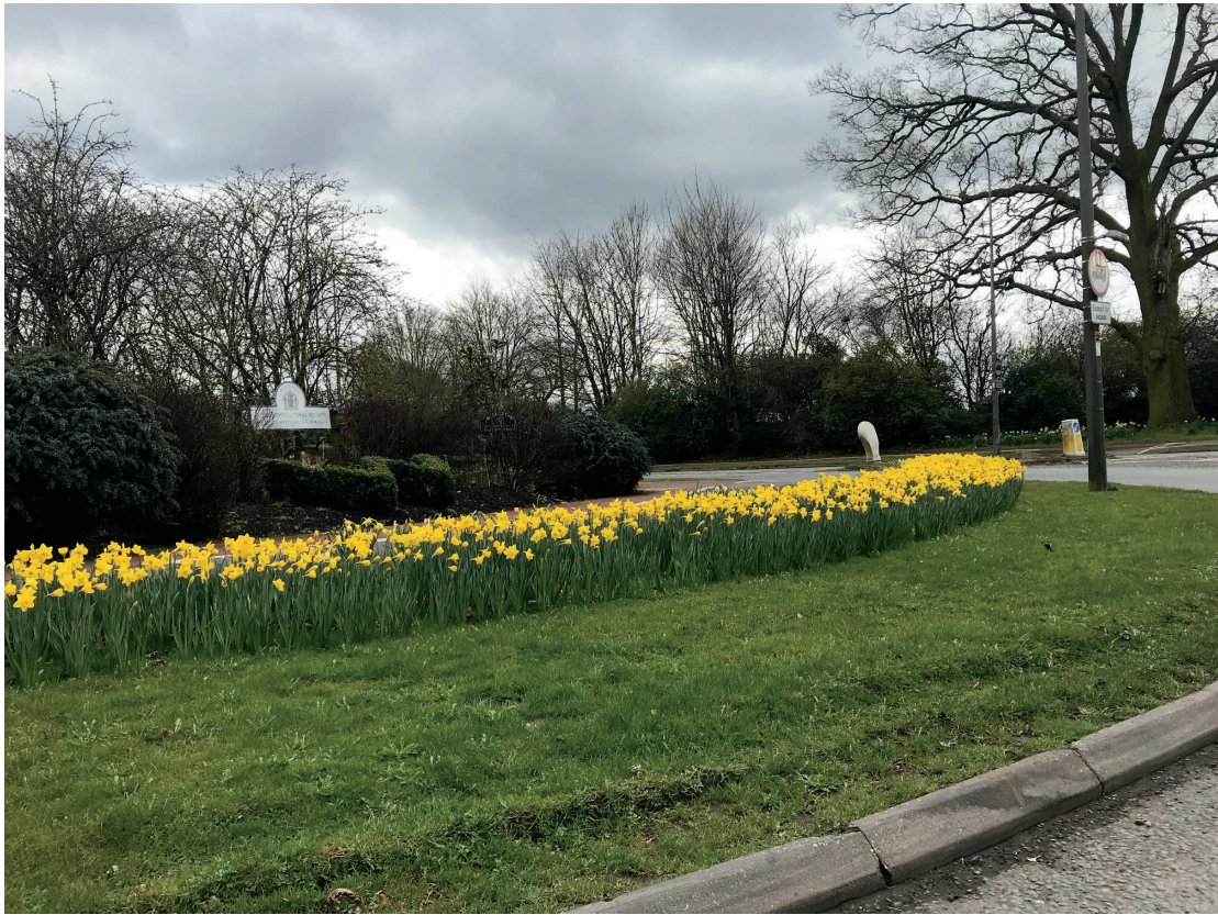
Once again, the spring displays of Narcissus, Hyacinthoides and Muscari bulbs provided vibrant up-lifting colours around the village.