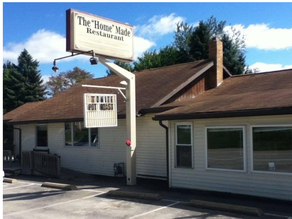
The "Home" Made Restaurant in Home, PA.

like a bunch of brothers and sisters running around. I definitely feel like a mom chasing her kids around sometimes. But I love them, and I would do anything for them.”