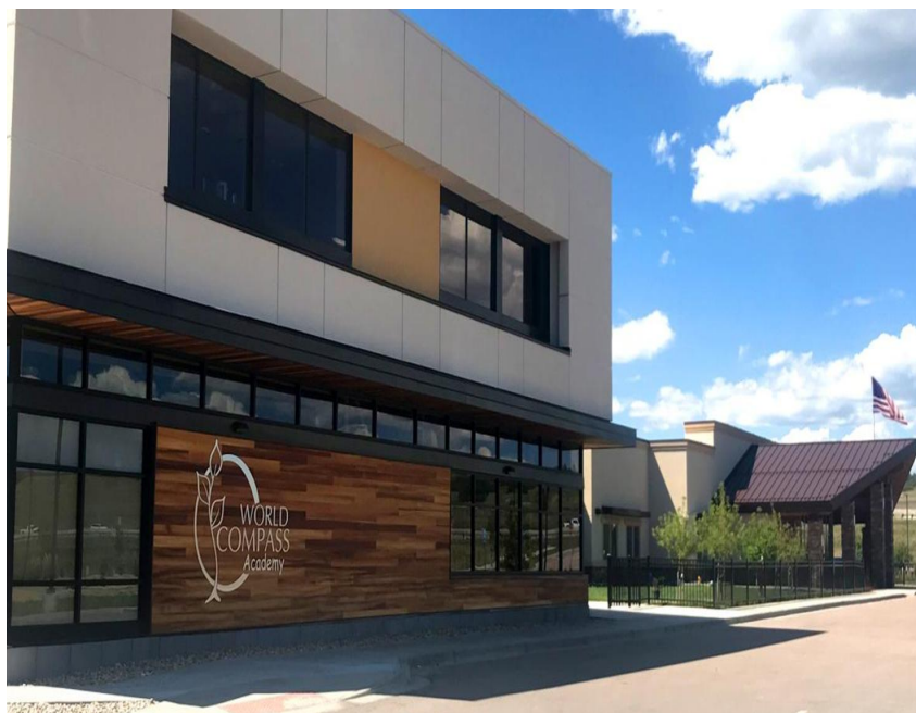
Welcome to our school!