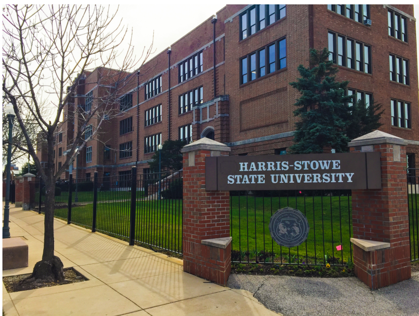
Harris-Stowe State University is a popular choice among Gateway students.

Don't know what college you want to attend?