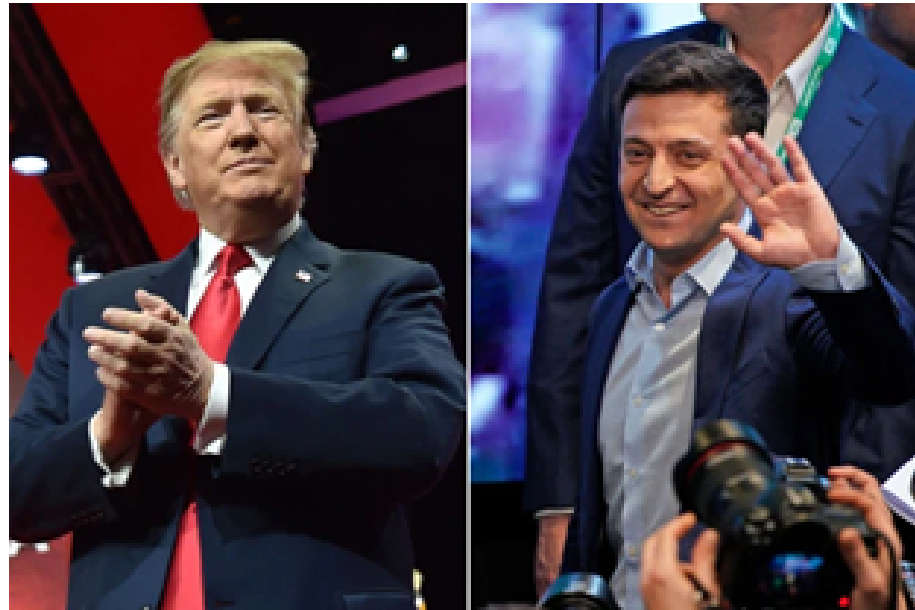
President Donald Trump and President Volodymyr Zelensky

On Wednesday, December 4, a public hearing was held. The GOP members (Republicans)