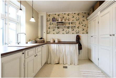
Example of a bid

Material cost + Labor cost + MRC % = Total