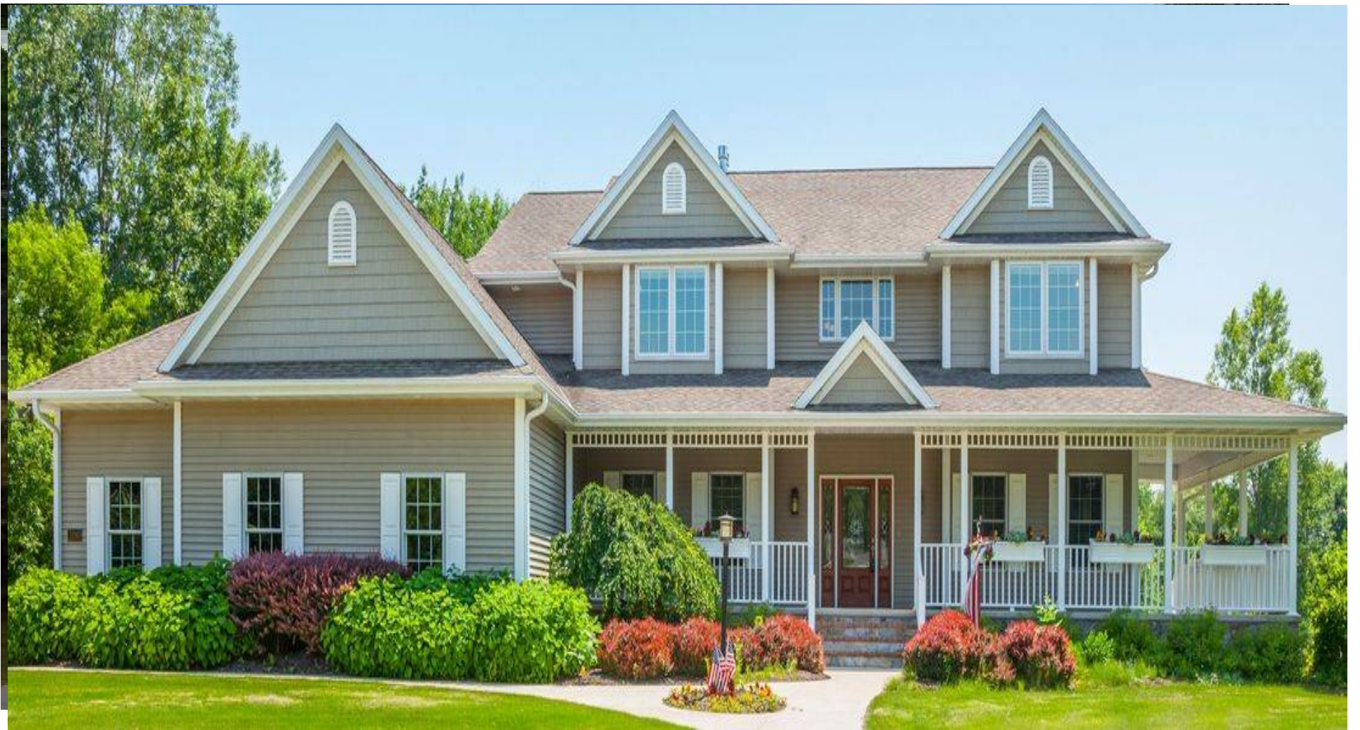
Buy the land, build your dream home; develop the rest of the land for townhouses and apartments