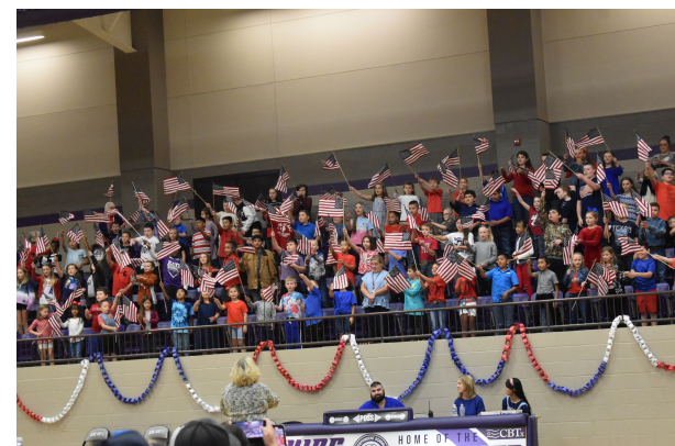
Elementary Students waving the American Flag while singing "You're a Grand Ol' Flag"