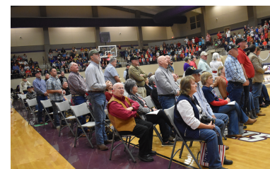
Our Veterans seated on the court in the Coliseum