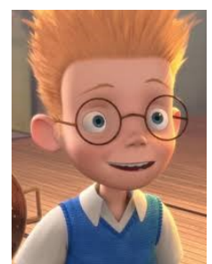
Ryan Streeter & Lewis from Meet the Robinsons