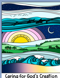
Caring for God's Creation

Immanuel Doppelgangers There are folks around here that look like famous people!