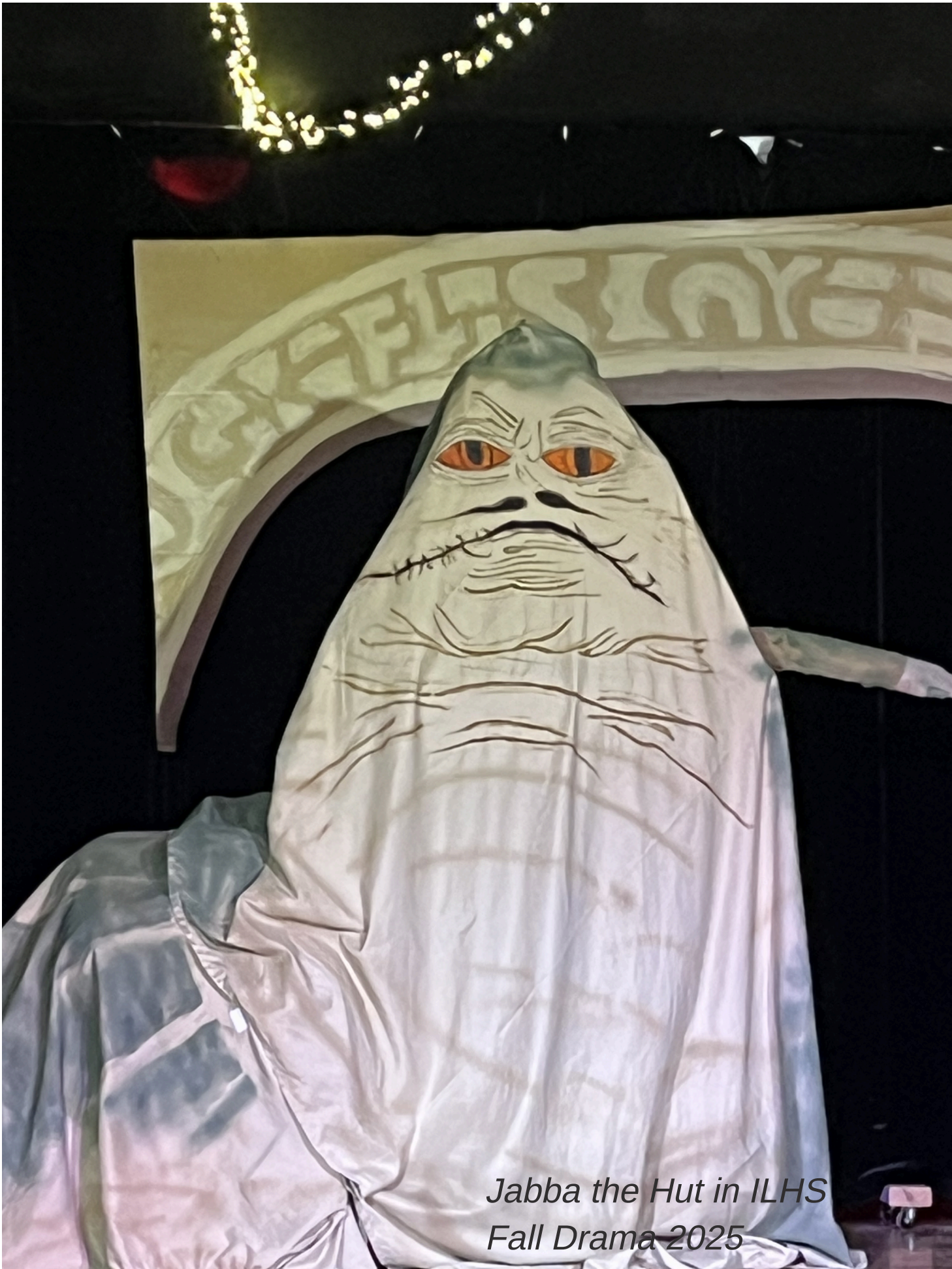
Jabba the Hut in ILHS Fall Drama 2025

This year's ILS fall play was titled "A Strange Thing Happened on the Way to the Death Star." The production featured students from 6th through 12th grades, with some roles also filled by 5th graders. The entire cast consisted of 32 talented actors.