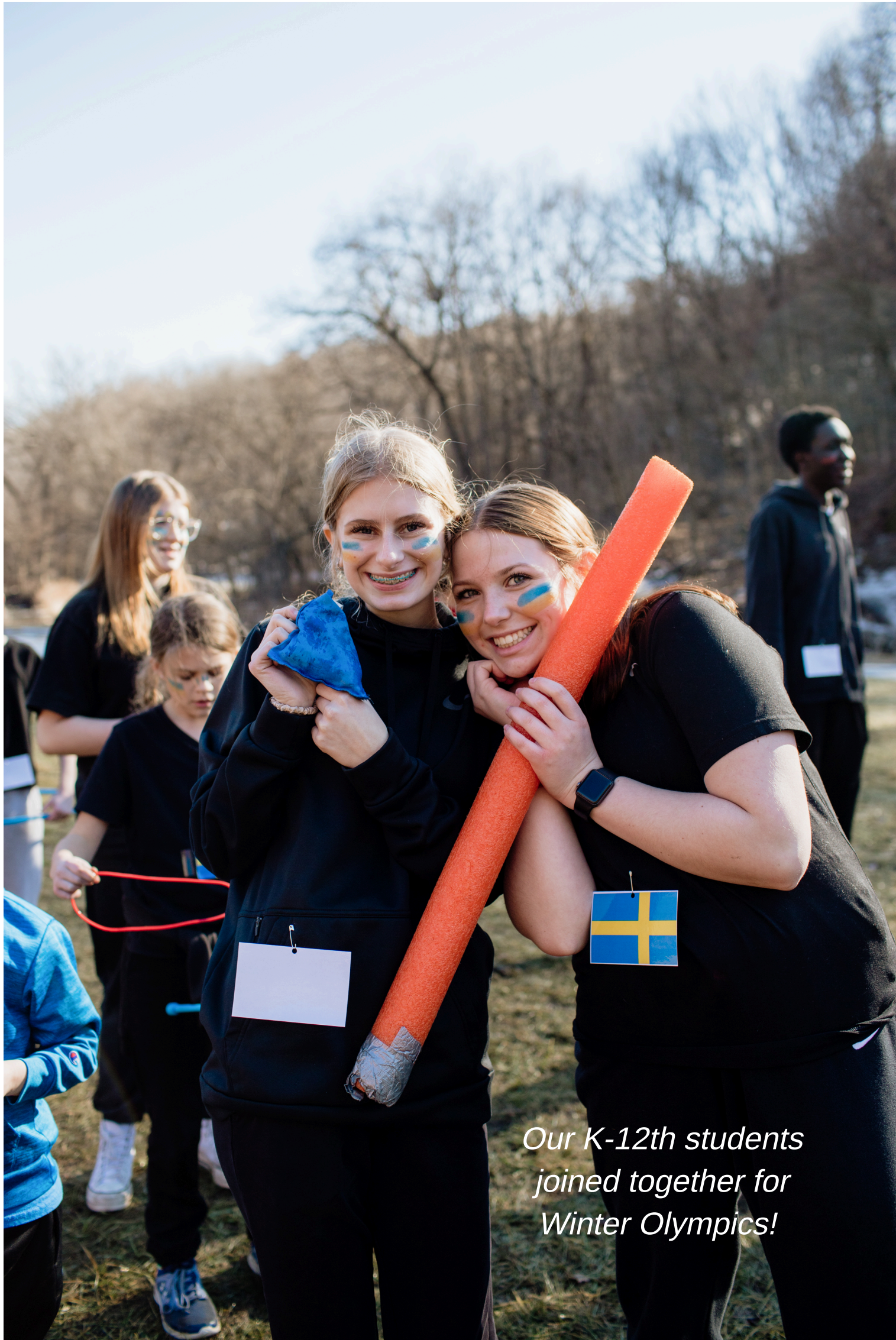
Our K-12th students joined together for Winter Olympics!