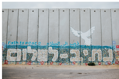
(Left) Protesting the wall and Israeli presence.