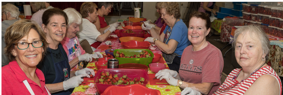
Hulling Party

At exactly 2 pm on June 23rd, the Strawberry Festival, a tradition of 75 years of Hollis deliciousness will begin. The Hollis Woman's Club and the Hollis Town Band will once again join forces to serve up local strawberry desserts accompanied by toe-tapping music. You can bet there will be a long line of festival goers ready to place their orders for strawberry desserts. Our advice is to arrive at Monument Square at least 30 minutes early (park at the Middle School, the Lawrence Barn, or behind the library).