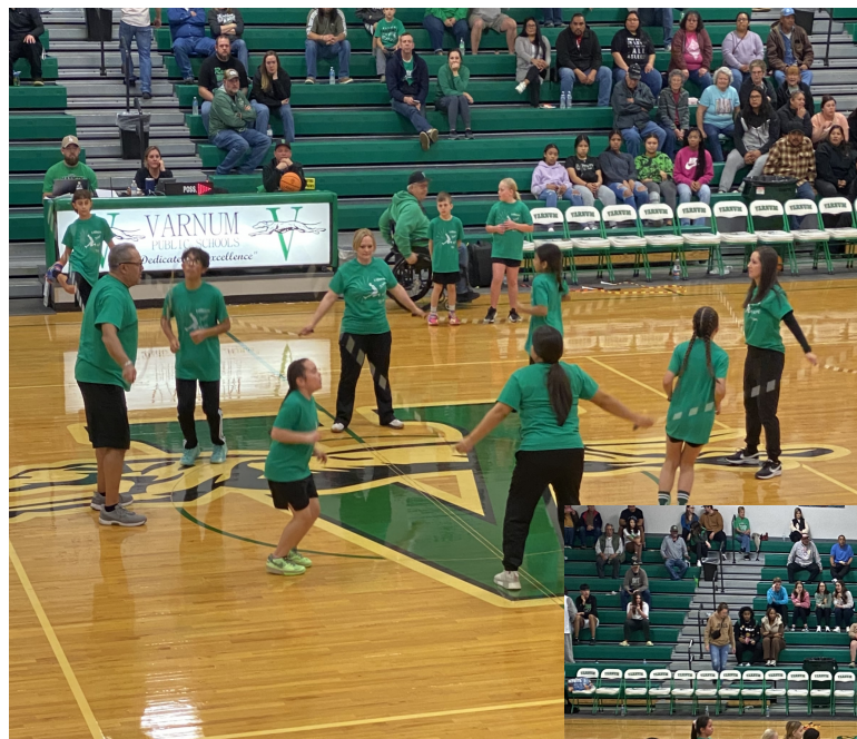
Varnum jump rope team showing off their sick skills at half time.