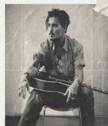
article by Tadelan Cartwright