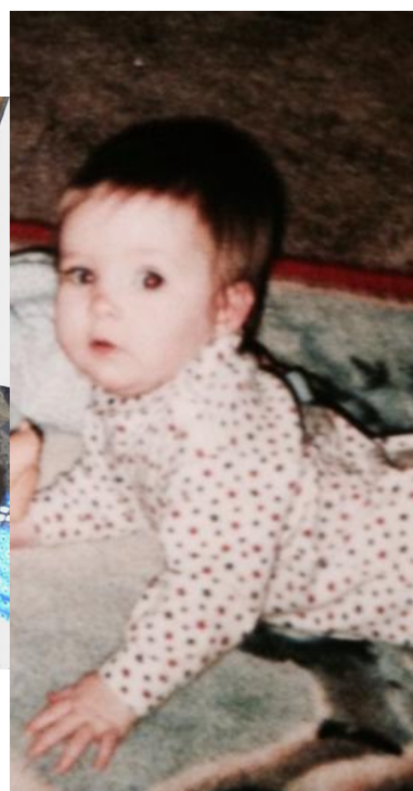
Sibling Pair 3