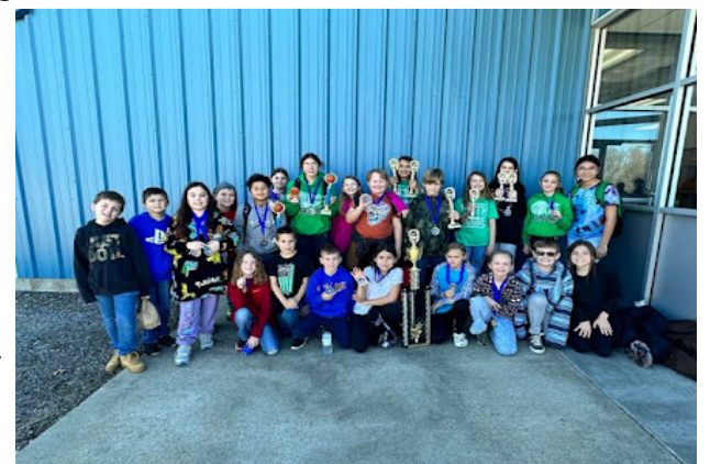
All the stunning scholars who helped bring home first place at the Justice Scholastic Meet.