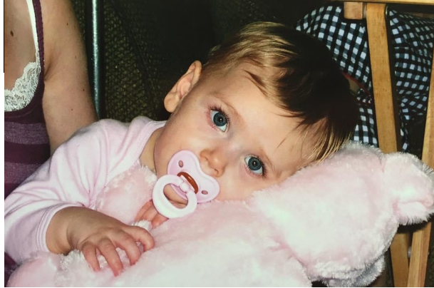
Sibling Pair 1