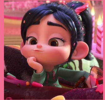
Vanellope von Schweetz