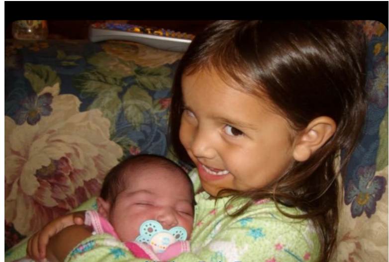
Sibling Pair B