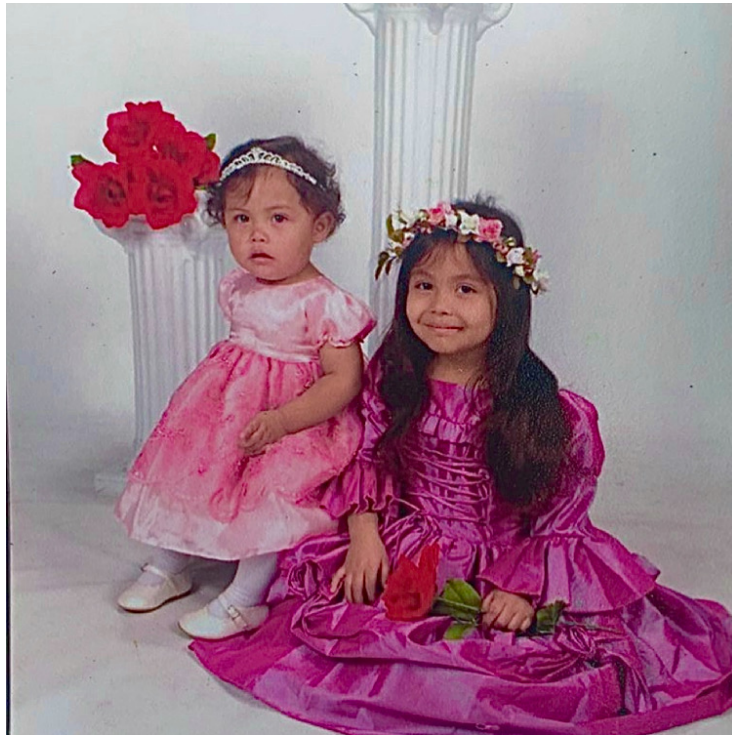
Sibling Pair A

Can you correctly match these Whippet siblings with their current selves?