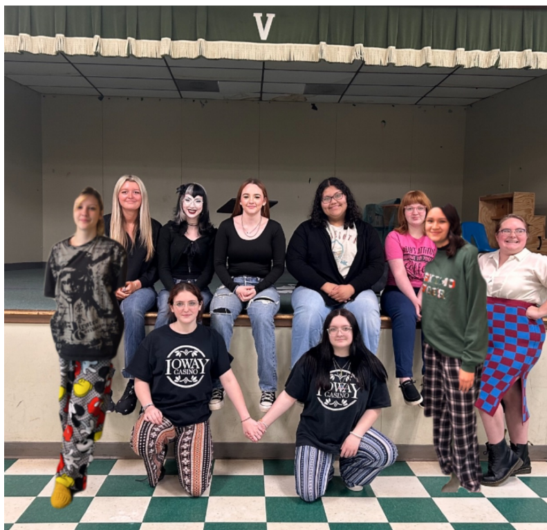
A brand new Whippet Weekly Staff picture!

Romans didn't use soap. The Romans invaded land all over the world.