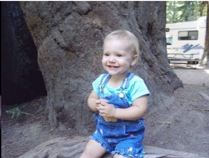
Little Whippet 2