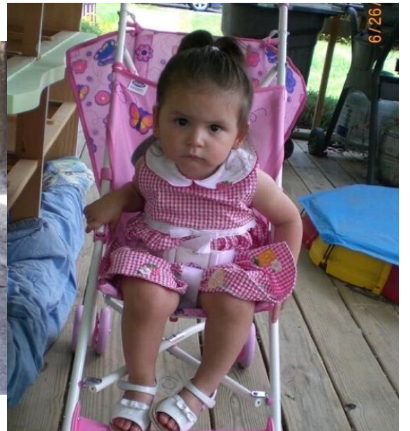
Little Whippet 3