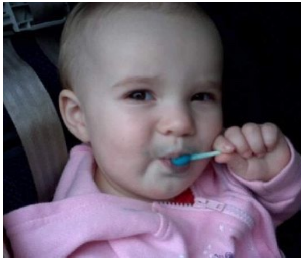
Little Whippet 1