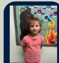
Pink & Purple