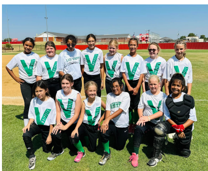
Elementary Softball Team