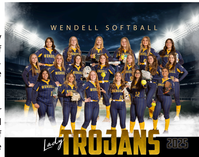
Lady Trojans 2025 team.

The Trojans have a few sayings they say to each other to get out of their heads. “No quicksand,” meaning don't get stuck on one thing and keep on moving. And one of their most important sayings, “Next play mindset” helps everything.