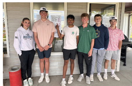
The Wendell Trojans golf team after the Pleasant Valley meet.