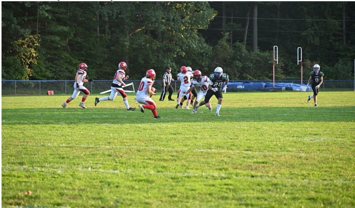
CVU Varsity Football at Colchester High School on September 13th