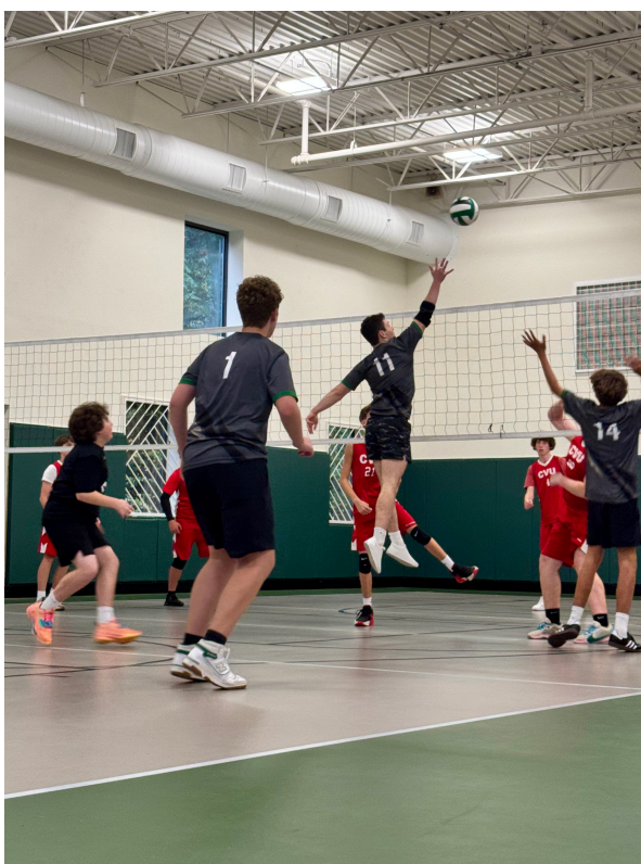
One of boys' JV volleyball teams against Vermont Commons School earlier this month.

Both girls and boys volleyball is off to a strong start this year.