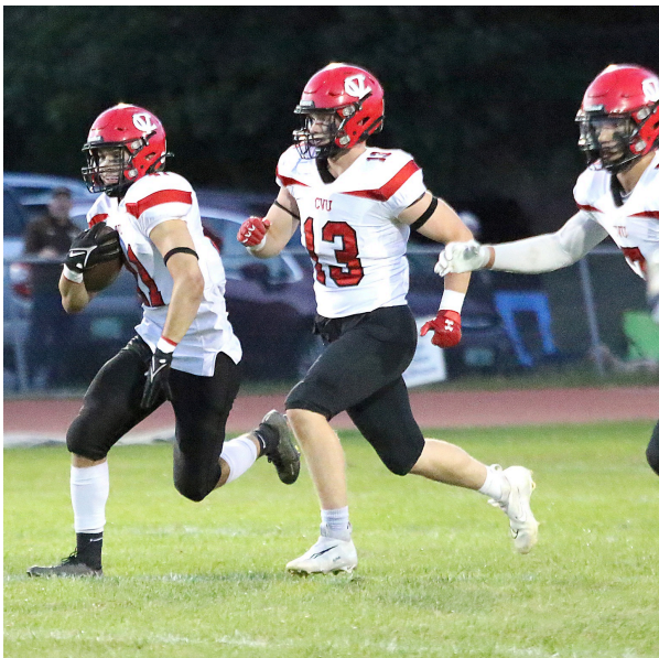
CVU Varsity Football at Essex High School on September 7th