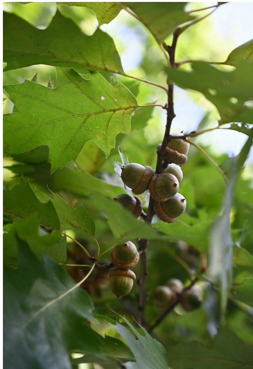
Acorns on an oak tree, taken earlier this fall