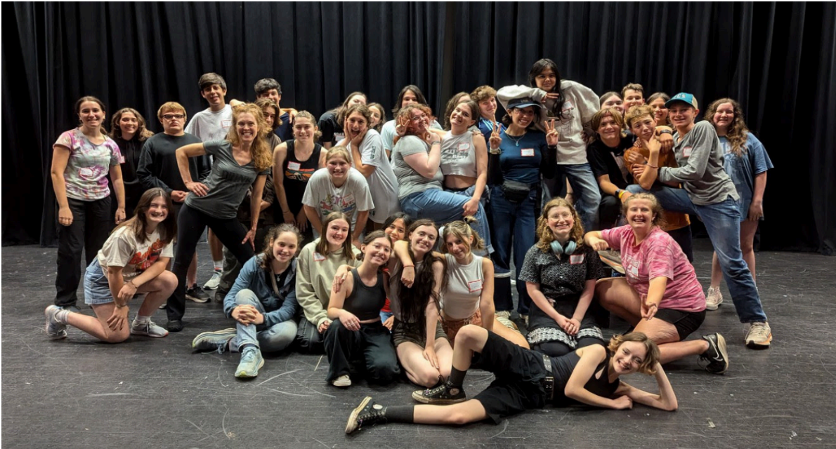
Cast of the Fall Footloose Musical

The show has already demonstrated an incredible amount of teamwork, practice,