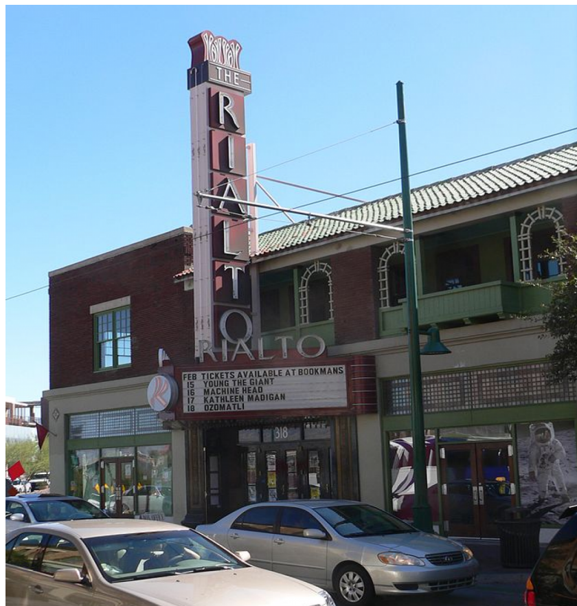
The Rialto Theater in February of 2012.

In December of 1965 Rosa Parks (1913 – 2005) refused to give up her seat on a public transportation bus to a white man. She was soon then arrested. This gave a jump start to the Montgomery bus boycott, which soon ignited the Civil Rights Movement of America.