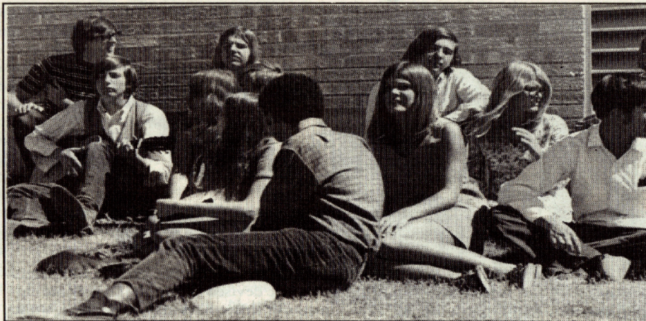
Times sure do change. Or do they? CDO students from 1969 gather on the grass to chat, much like the students of today. There are very few remaining items from the original campus.

The above story originally appeared in the April, 1997 issue of the Palantir.