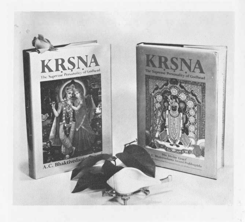
KṛṢṇA, THE SUPREME PERSONALITY OF GODHEAD (ISKCON PRESS, 1970)

The supremely rich, powerful, famous and beautiful Personality of Godhead, who is free from all material attachment, is now available in book form. KṛṢṇA, the Supreme Personality of Godhead, 750 pages of transcendental reading matter, opulently illustrated with 82 full-color plates, presents the eternal, blissfull pastimes of the Supreme Lord Śrī Kṛṣṇa as they are revealed in the Tenth Canto of Śrīmad-Bhāgavatam, the ripened fruit of all Vedic literatures. The KṛṣṇA Books, potent in message and rich in design, offer mankind the opportunity to attain the highest benefit by understanding the true nature of the pastimes of the Supreme Lord. Everyone would do well to procure this deluxe two-volume set to read and keep at home as a great treasure. 750 pp., 82 full-color illustrations $16.00 (per vol.—$8.00)