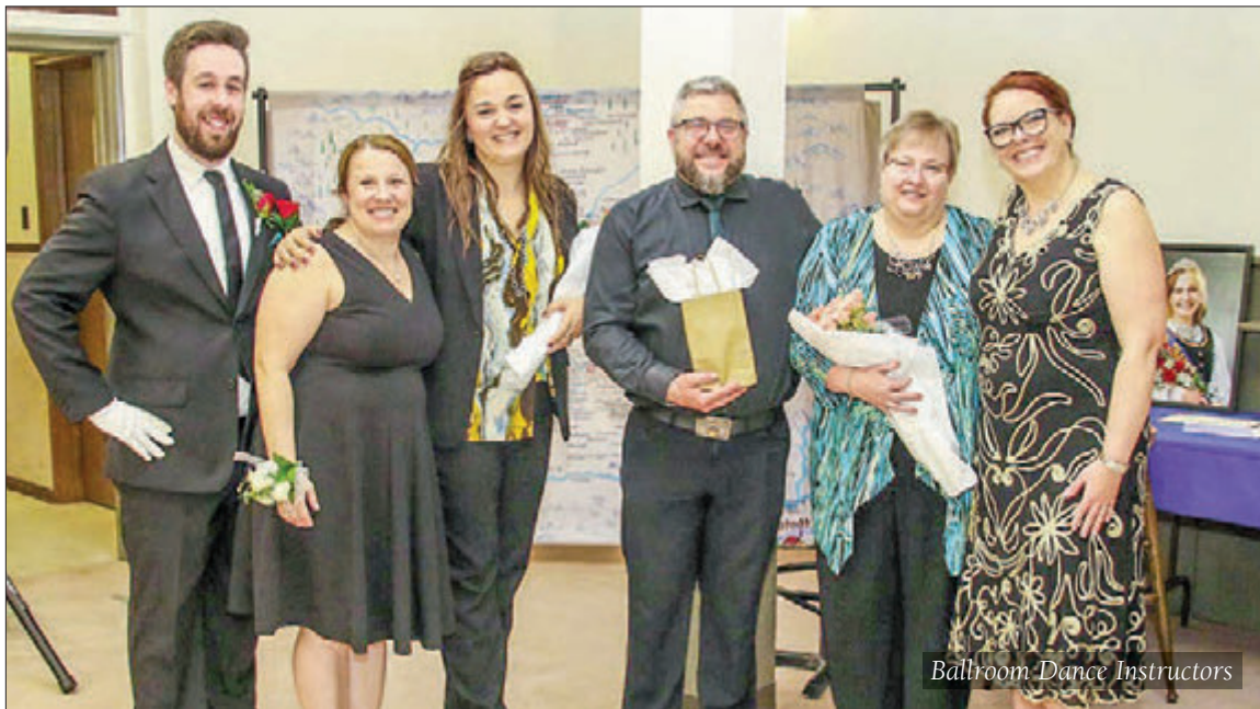
Ballroom Dance Instructors