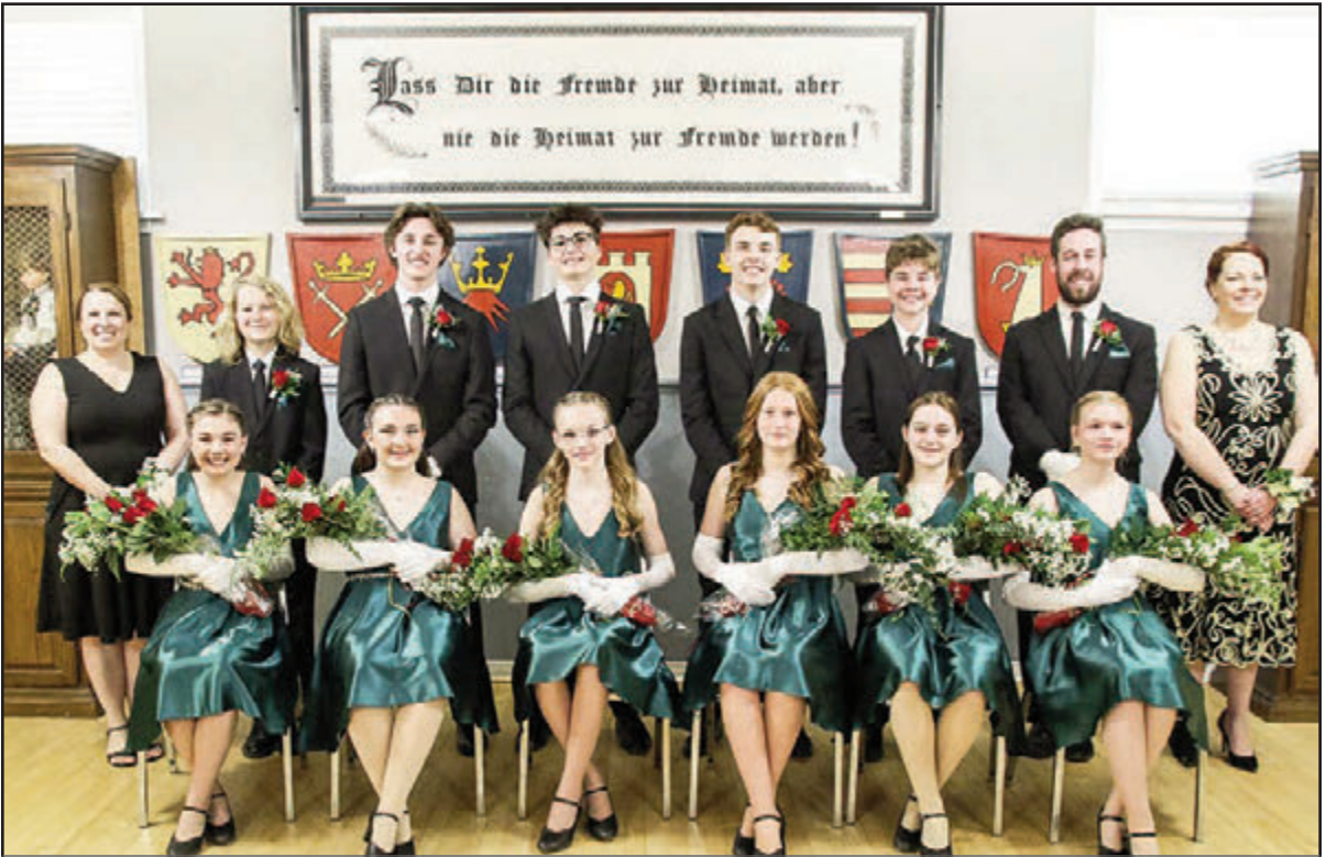
TCK Ballroom Dance Graduating Class - 2024