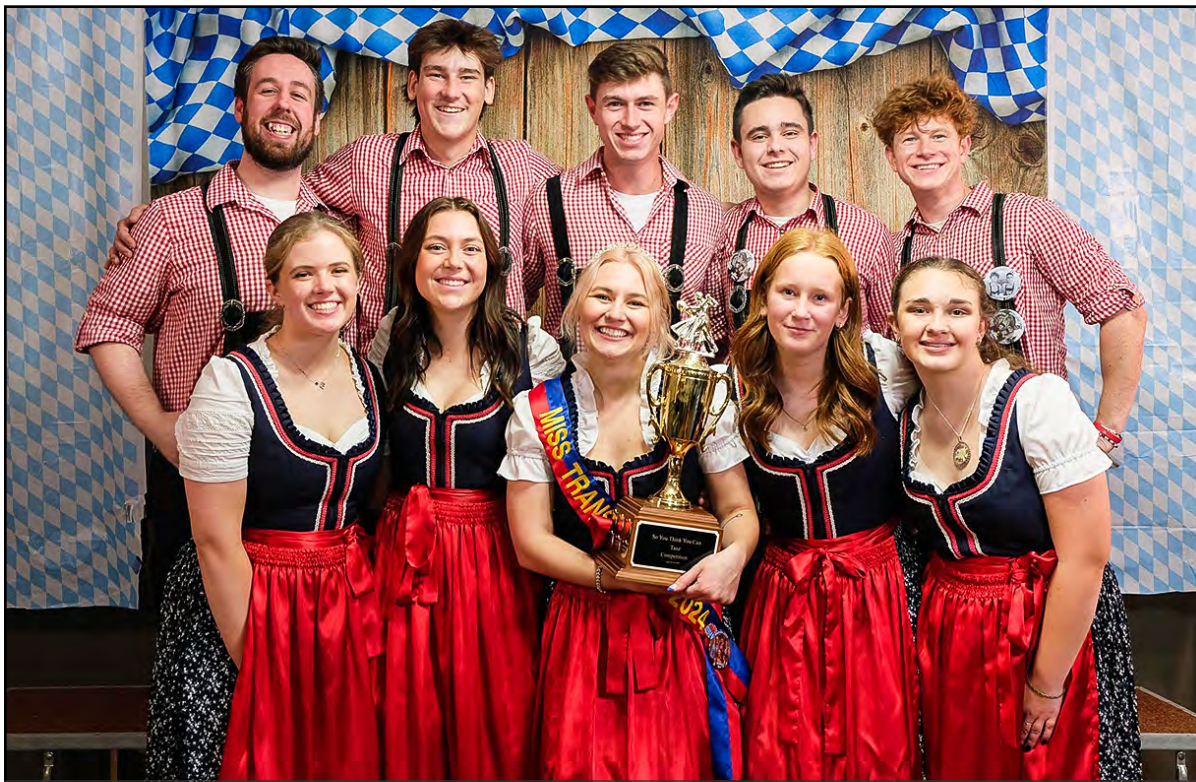
TCK Youth Dance Group – Winners of the 2024 So You Think You Can Tanz Competition