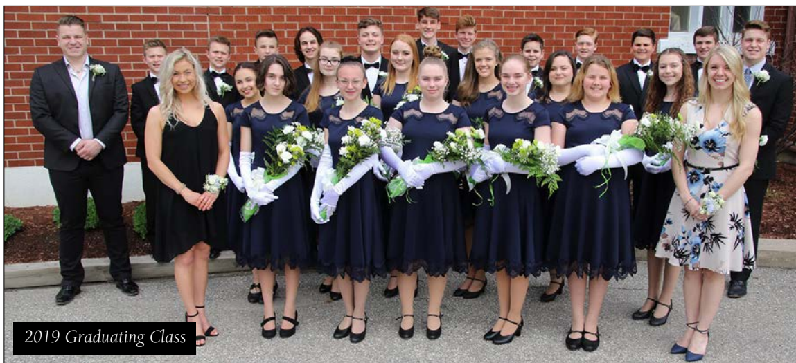
2019 Graduating Class