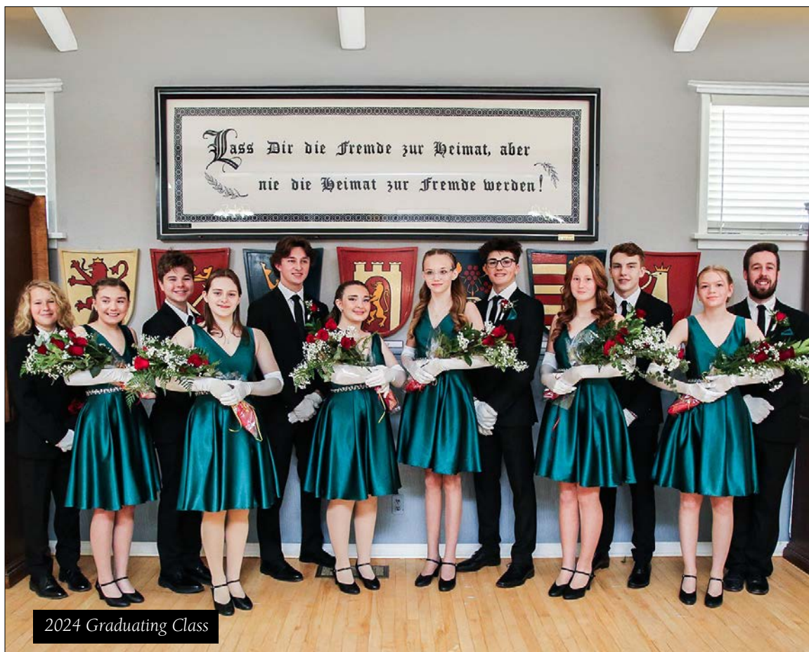
2024 Graduating Class